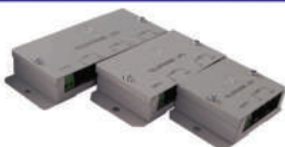
Line Protection Units